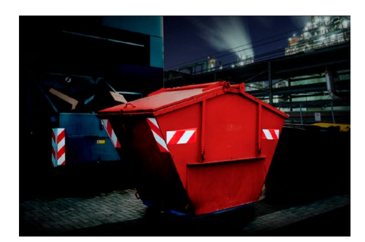
Avery Dennison Chevron White/Red used for container hazard marking.