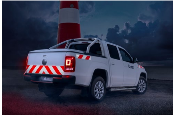
Avery Dennison Chevron White/Red used for vehicle marking according to DIN30710 and TPESC-B.

DISCLAIMER - All Avery Dennison statements, technical information and recommendations are based on tests believed to be reliable but do not constitute a guarantee or warranty. All Avery Dennison products are sold with the understanding that purchaser has independently determined the suitability of such products for its purposes. All Avery Dennison's products are sold subject to Avery Dennison's general terms and conditions of sale, see http://terms.europe.averydennison.com